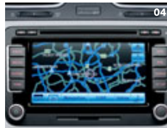
04 RNS 510 DVD touch-screen navigation/radio system.

When it comes to in-car entertainment systems and communications packages, those looking to install a technologically advanced or upgraded system are spoilt for choice. Whether you require concert hall acoustics, or the latest navigation system, these factory-fitted options provide state-of-the-art technology and connectivity. Choose the system that best meets your needs, then sit back and enjoy the benefits.