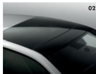
02 Panoramic tilting sunroof.

The importance of comfort and convenience cannot be over-emphasised. Choose from this range of factory-fitted options to create an interior that meets your individual needs, and makes life just that little bit more comfortable and convenient. From a Panoramic tilting sunroof to a Winter pack, these essential luxuries are designed to help you relax and take the stress out of driving, adding not only a touch of luxury, but also providing invaluable practical assistance.