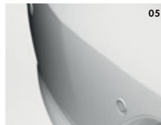
05 Rear parking sensors.

Safety and security have to be a primary consideration, for only when you are feeling totally safe and protected can you completely relax. Whether you are looking to ensure the safety of your passengers, enhance rear safety or make life just that little easier, this range of safety and security features will help you protect passengers and make your Scirocco more secure, enabling you to enjoy the driving experience so much more.