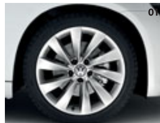
01 'Interlagos' 8J x 18 alloy wheels.

Add a touch of style and personality with this great choice of alloys. Alloys add a distinctively sporting look to your car, carefully chosen to enhance the exterior styling of every model, these options give you plenty of opportunity to express your individuality and transform the appearance of your Scirocco.