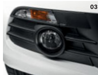
03 Front fog lights.

The exterior styling of your Scirocco is not only an expression of its personality, but makes a powerful statement about your own individuality and taste. These factory-fitted options provide an easy and effective way to create a striking visual appearance with great aesthetic appeal, while enjoying some important practical benefits. From Metallic and Pearl Effect paint to front fog lights, choose the options best suited to your needs and enhance not only your Scirocco's exterior looks, but your driving experience too.