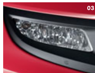
03 Front fog lights with static cornering function.

The exterior styling of a car is not only an expression of its personality, but makes a powerful statement about your own individuality and taste. These factory-fitted options provide an easy and effective way to create a striking visual appearance with great aesthetic appeal, whilst enjoying some important practical benefits. From special paint to front fog lights, choose the options best suited to your needs and enhance not only your Polo's exterior looks, but your driving experience too.