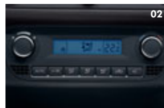
02 Electronic climate control air conditioning.

The importance of comfort and convenience cannot be over-emphasised. Choose from this range of factory-fitted options to create an interior that meets your individual needs, and makes life just that little bit more comfortable and convenient. From electronic climate control air conditioning to a Winter pack, these essential luxuries are designed to help you relax and take the stress out of driving, adding not only a touch of luxury, but also providing invaluable practical assistance.