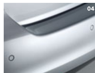
04 Parking sensors (Sensor pack).

Safety and security have to be a primary consideration, for only when you are feeling totally safe and protected can you completely relax. Whether you are looking to ensure the safety of your passengers, enhance rear safety or make life just that little easier, this range of safety and security features will help you protect passengers and make your Golf Estate more secure, enabling you to enjoy the driving experience so much more.