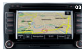
03 DVD satellite navigation.

Whether you are looking to upgrade the radio system or require the latest navigation system these factory-fitted options provide the ultimate in advanced electronics, state-of-the-art technology and connectivity. Choose the system that best meets your needs, then sit back and enjoy the benefits.