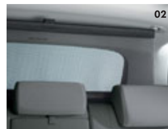
02 Net partition.

The importance of comfort and convenience cannot be over-emphasised. Choose from this range of factory-fitted options to create an interior that meets your individual needs, and makes life just that little bit more comfortable and convenient. From 2Zone electronic climate control to a front centre armrest, from a panoramic sunroof to a Winter pack, these essential luxuries are designed to help you relax and take the stress out of driving, adding not only a touch of luxury, but also providing invaluable practical assistance.