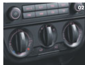
02 'Climatic' semi-automatic air conditioning.

The importance of comfort and convenience cannot be over-emphasised. Choose from this range of factory-fitted options to create an interior that meets your individual needs, and makes life just that little bit more comfortable and convenient. From 'Climatic' semi-automatic air conditioning to easy entry sliding seats, from a sunroof to a Luxury or Winter pack, these essential luxuries are designed to help you relax and take the stress out of driving, adding not only a touch of luxury, but also providing invaluable practical assistance.