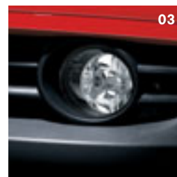
03 Front fog lights.

The exterior styling of a car is not only an expression of its personality, but makes a powerful statement about your own individuality and taste. These factory-fitted options provide an easy and effective way to create a striking visual appearance with great aesthetic appeal, while enjoying some important practical benefits. From the colour pack to front fog lights, choose the options best suited to your needs and enhance not only your Fox's exterior looks, but your driving experience too.