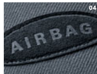
04 Side airbags.

Safety has to be a primary consideration, for only when you are feeling totally safe and protected can you completely relax. This choice of safety features will help you protect passengers and keep your Fox stay safely on course, enabling you to enjoy the driving experience so much more.