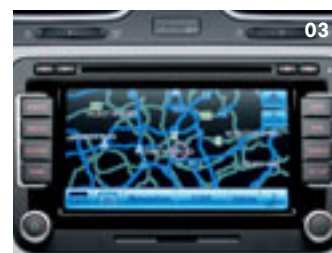
03 RNS 510 DVD touch-screen navigation/radio system.

When it comes to in-car entertainment systems and communications packages, those looking to install a technologically advanced or upgraded system are spoilt for choice. Whether you require concert hall acoustics, the latest navigation system or a digital radio receiver, these factory-fitted options provide the ultimate in advanced electronics, state-of-the-art technology and connectivity. Choose the system that best meets your needs, then sit back and enjoy the benefits.