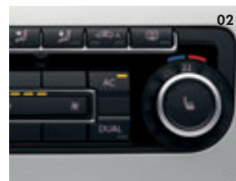
02 2Zone electronic climate control.

The importance of comfort and convenience cannot be over-emphasised. Choose from this range of factory-fitted options to create an interior that meets your individual needs, and makes life just that little bit more comfortable and convenient. 2Zone electronic climate control, wind deflector or winter pack, these essential luxuries are designed to help you relax and take the stress out of driving, adding not only a touch of comfort, but also providing invaluable practical assistance.